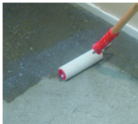
Applying Primer G with a roller